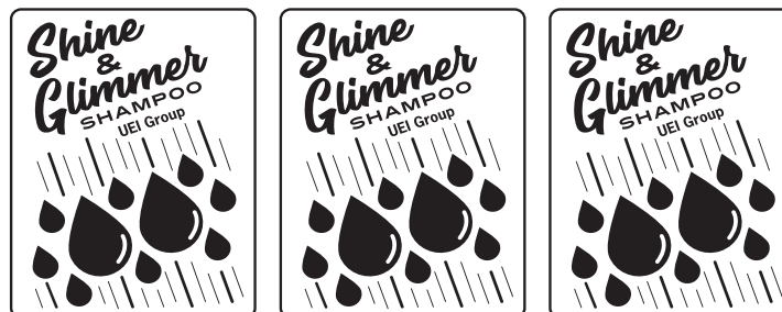
ART NEEDED BY UEI® GROUP IN OUTLINE MODE