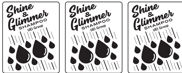
ORIGINAL FILE ART

* Add all necessary information for manufacturing the order including any art instructions.